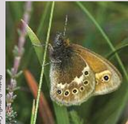
Large heath butterfly