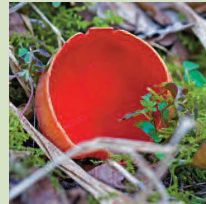
Scarlet elf cup fungus